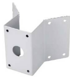
SCX-300KM Corner Mount Adaptor